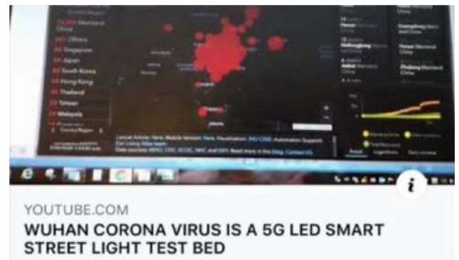
Example of misinformation, Source: Cellan-Jones, 2020

The flow of information has been weaponized in recent years. Bradshaw & Howard (2019) found that the number of countries using misinformation for political purposes online had jumped from 28 in 2017 to 70 in 2019. The most prominent countries in their findings are now also involved in a misinformation campaign against their own citizens as well as against rival states.