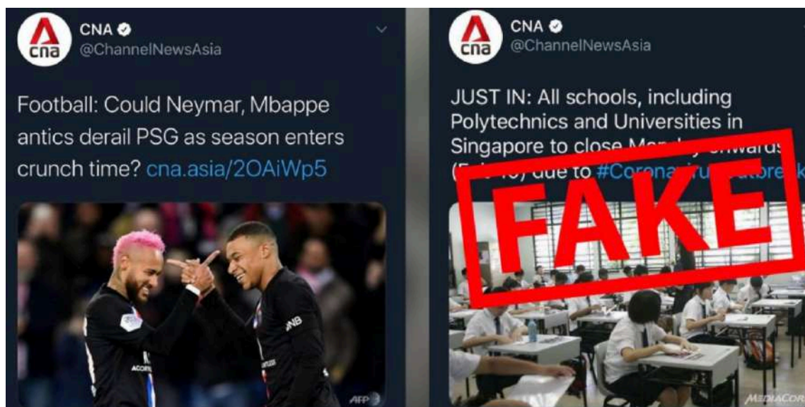
Example of Misinformation, Source: Lim, 2020

However, the biggest and most brazen attacks seem to have been launched by the Russian state authorities. An internal European Union briefing states that Russia's state-aligned media has launched a significant disinformation campaign against the West to worsen the impact of the coronavirus, generate panic and sow distrust (Emmott, 2020). "For the Kremlin, Covid-19 is an opportunity as well as a crisis," says Foxall (2020). "Russia has long sought to subvert the rules-based international order by creating fractures within Western societies, or taking advantage of pre-existing ones."